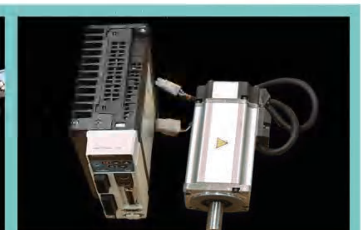
松下伺服电机及驱动器 Panasonic servo system