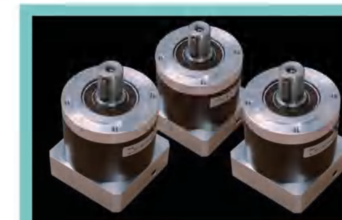
德国NEUGART减速机 Germany neugart speed reducer