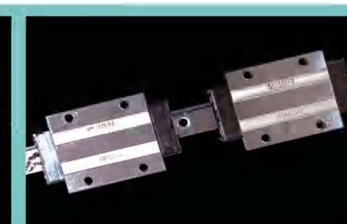
直线滚珠导轨 Straight-line roll bead guide